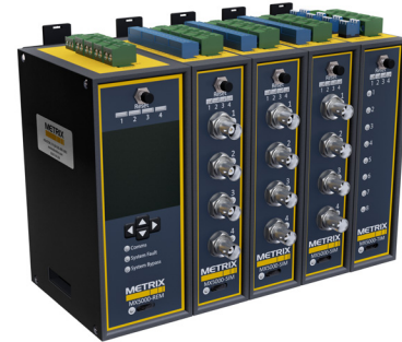
MX5000 Monitoring System

The MX5000 modular architecture allows scalable configuration tailored to the machine.