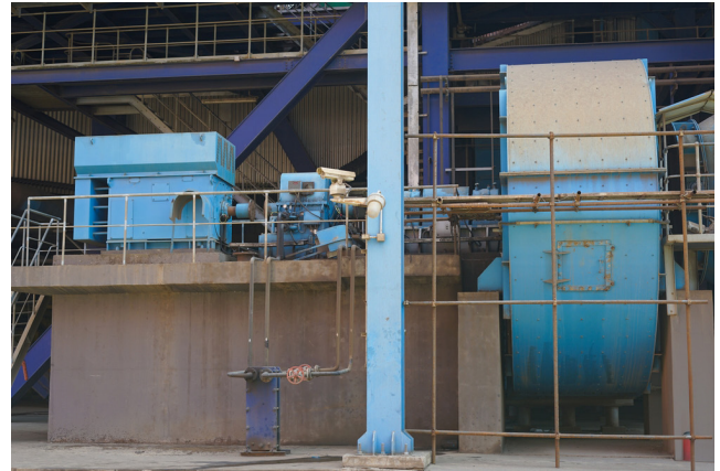
Forced Draft Fan

Large ID and FD fans often operate at high horsepower and moderate speeds, typically